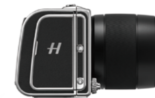
907X 50C 2019