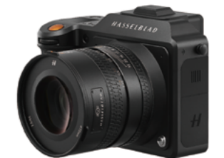
X2D 100C 2022