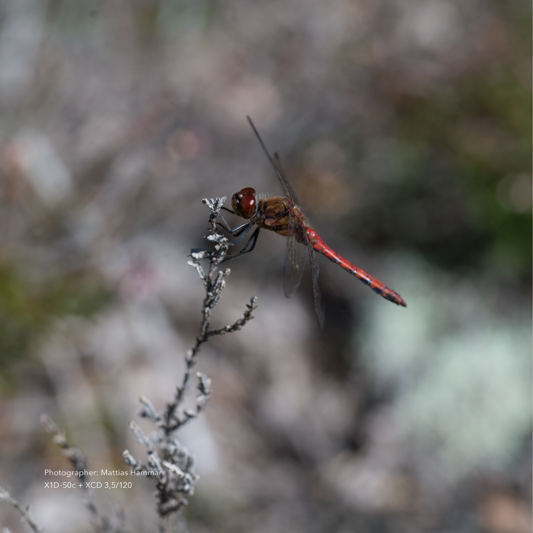
X1D-50c + XCD 3,5/120