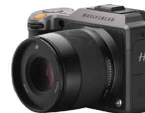
X1D II 50C 2019