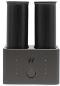
Battery Charging Hub