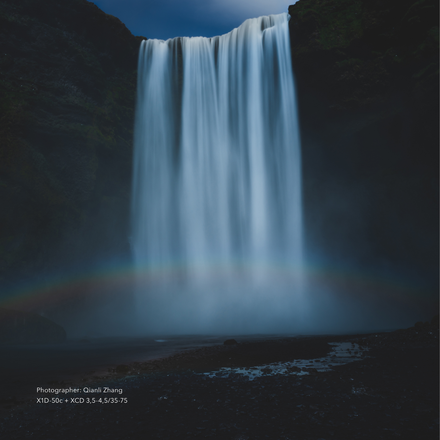
X1D-50c + XCD 3,5-4,5/35-75