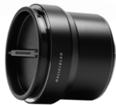
XV Lens Adapter