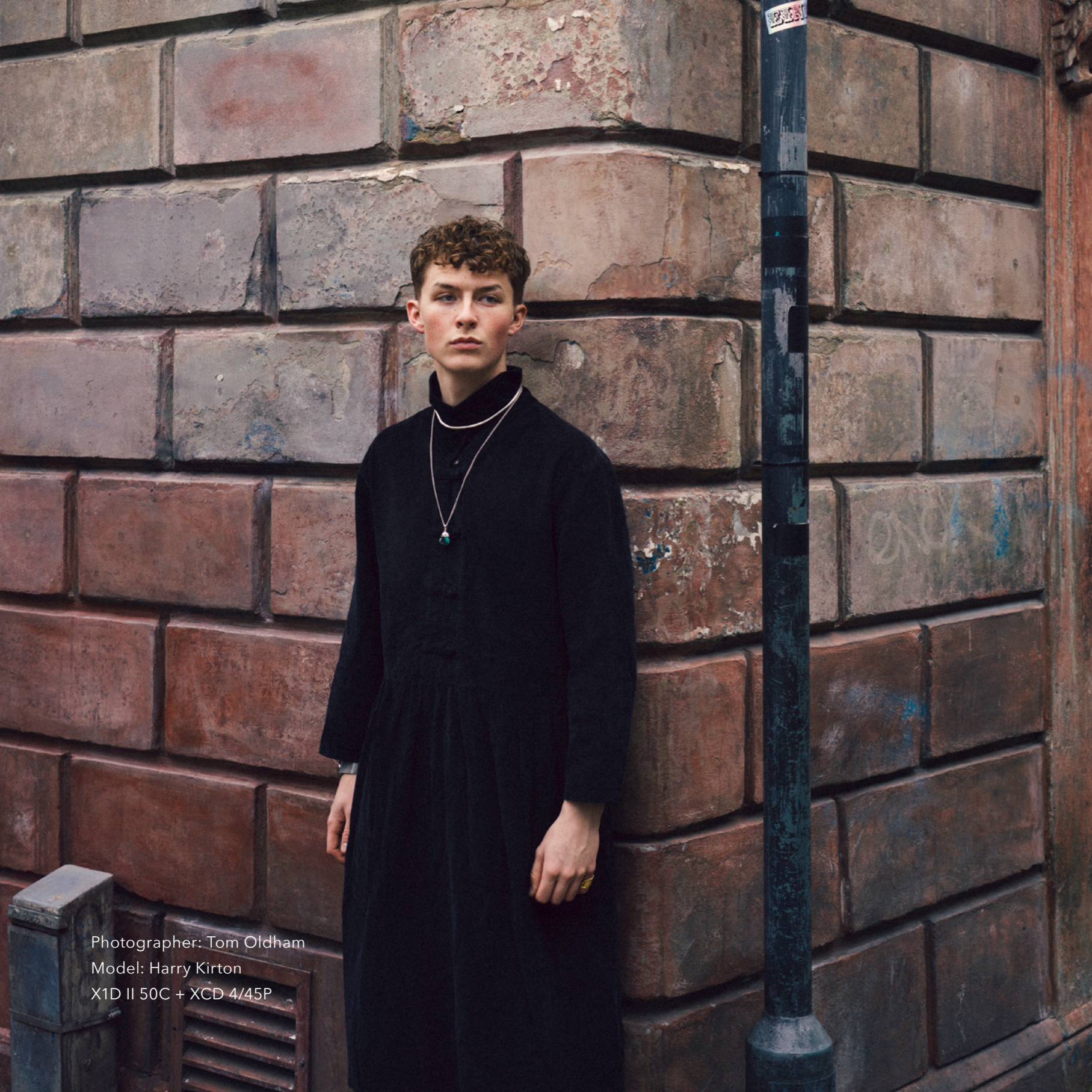
Model: Harry Kirton X1D II 50C + XCD 4/45P