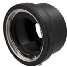
XH Lens Adapter