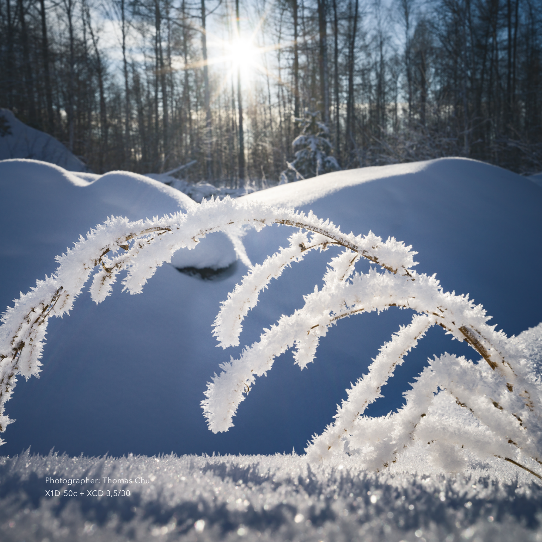
X1D-50c + XCD 3,5/30