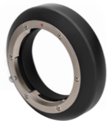
XPan Lens Adapter