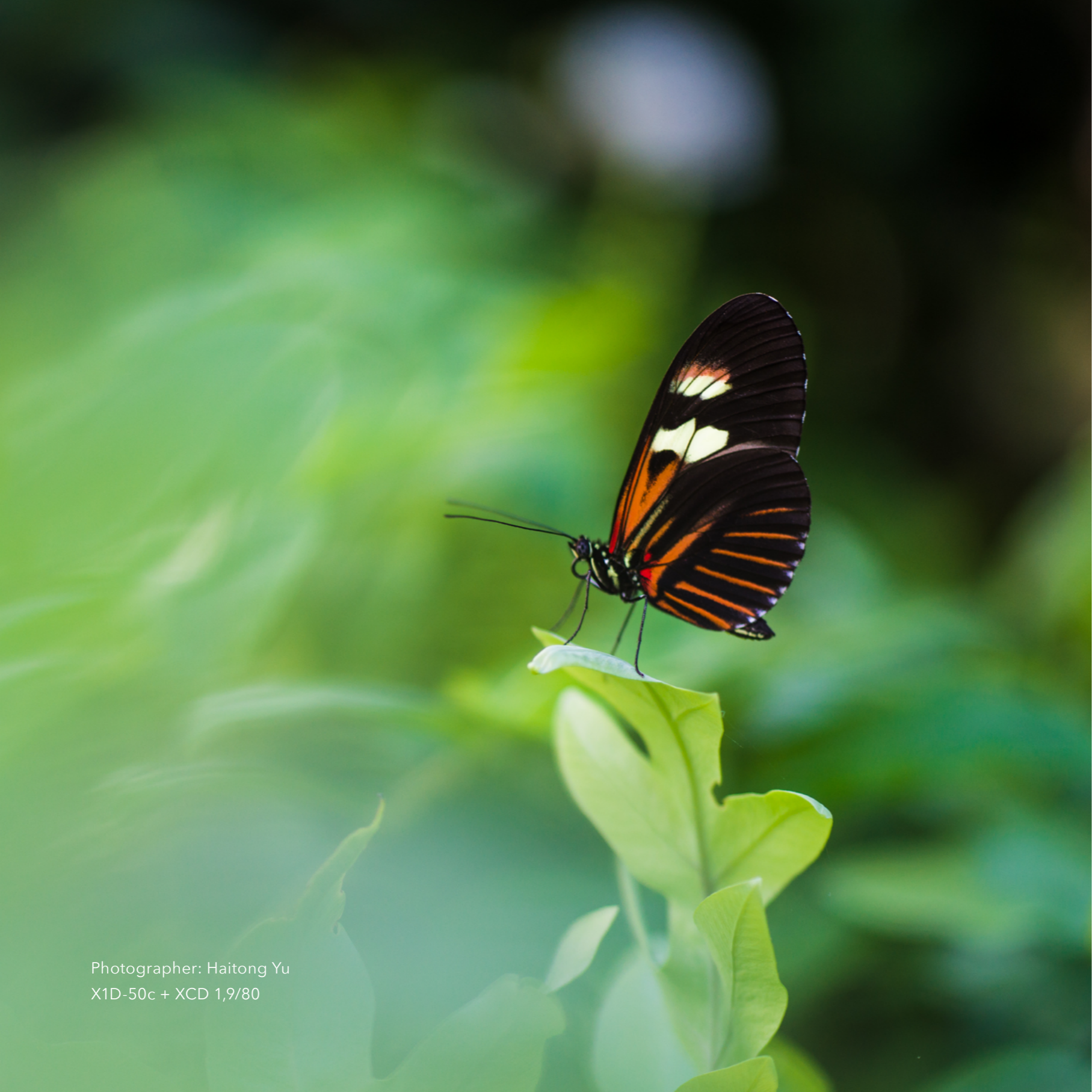
X1D-50c + XCD 1,9/80