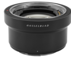
XH Converter 0,8