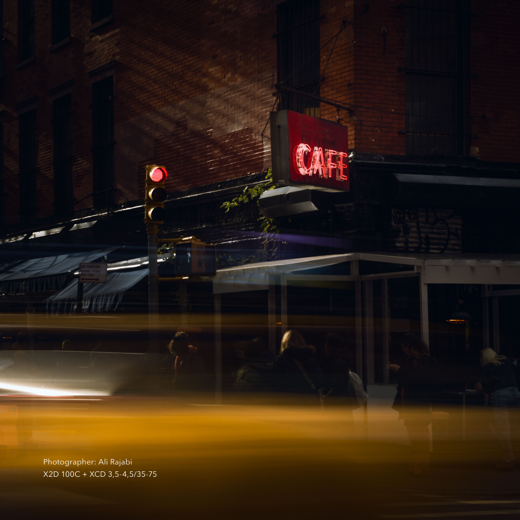
X2D 100C + XCD 3,5-4,5/35-75