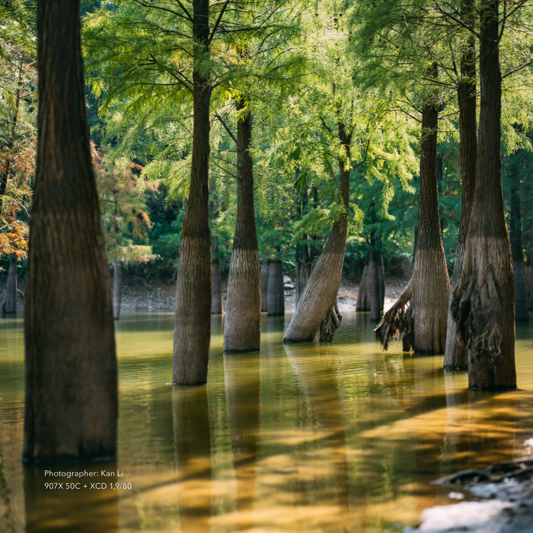
907X 50C + XCD 1,9/80