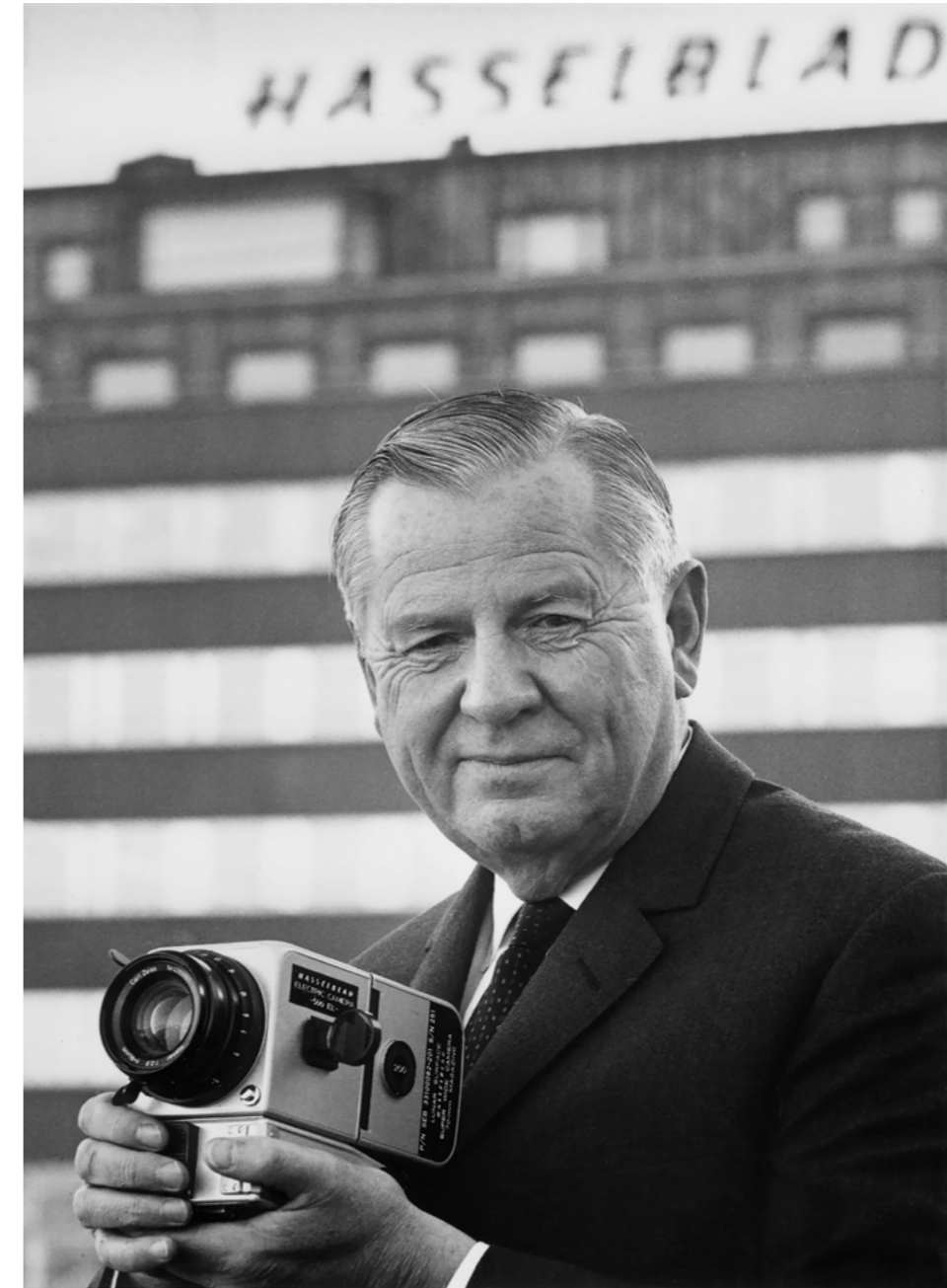
Founder: Victor Hasselblad

With excellent image quality, exquisite Scandinavian design, and meticulous craftsmanship, Hasselblad continues to expand the bounds of storytelling through imagery, empowering users to achieve their creative vision.