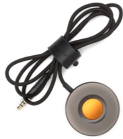
Release Cord X [1]